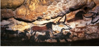
Cave Painting ca. 15,000 B.C.