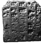
Sumerian Tablet 3500 B.C.