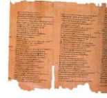
2400 BC - Papyrus Scrolls